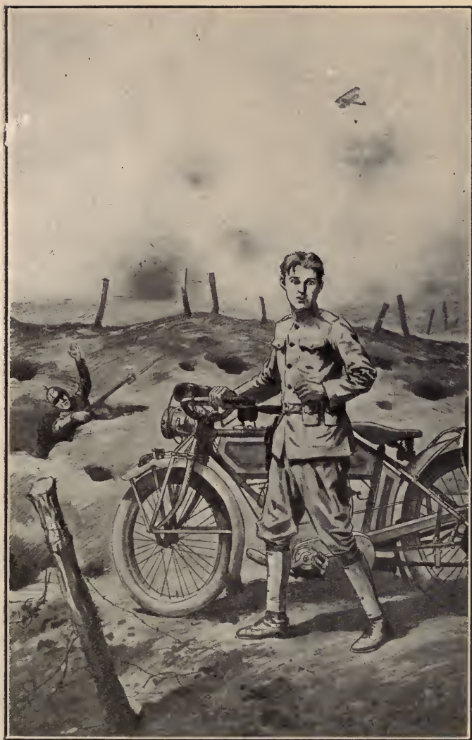
TOM WAS SURPRISED TO FIND HIMSELF UNINJURED, WHILE THE BOCHE COLLAPSED INTO HIS SHELL HOLE.